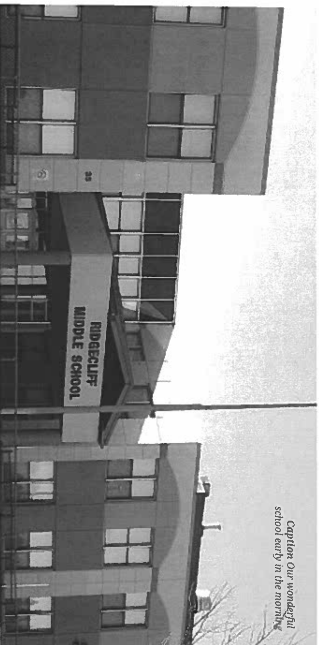
Caption Our wonderful school early in the morning